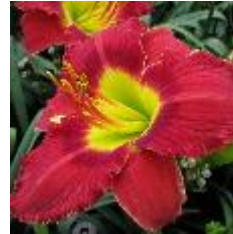
Carolina Red Bug