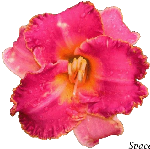
Spacecoast Early Bird