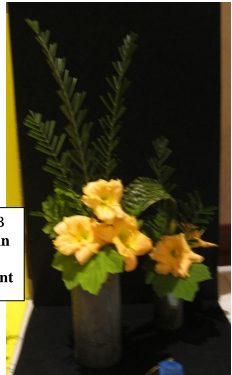
Section 1, Class B Creative Design in Two Units with Stretch Component