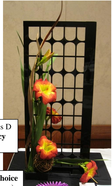
Section 2, Class D Transparency Design