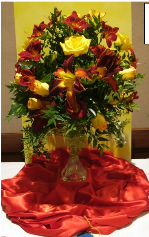
Section 1, Class A Traditional Mass Design

The design section of the 2011 Richmond Flower Show had some beautiful displays. Enjoy the following pictures of those arrangements winning best in class.