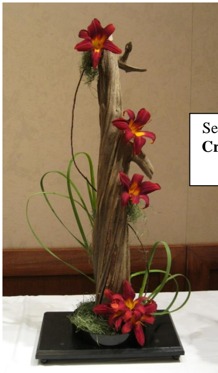
Section 2, Class E Creative Vertical Line Design

Congratulations to all the arrangement designers. The design section adds so much to the overall show and inspires all of us to design more with daylilies.