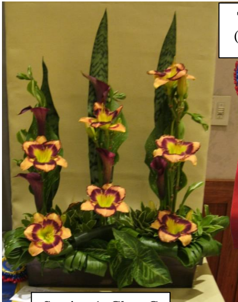
Section 1, Class C Parallel Design (three or more)