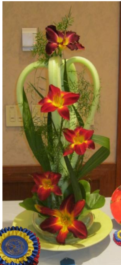
Class C: “Sizzling in the Sunshine” Beth Burgess (A Reflective Design staged in front of a background panel)