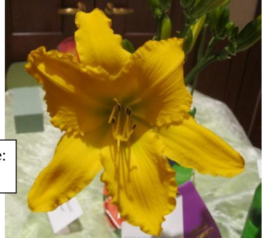
Extra Large: JAGUAR