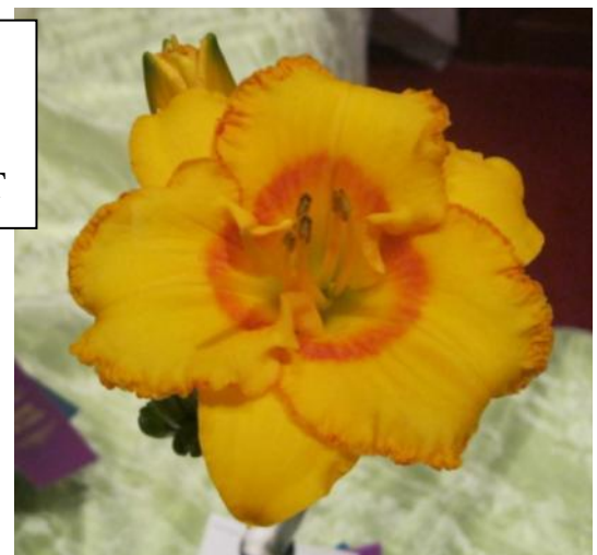
Small: SMALL WORLD HALF PINT