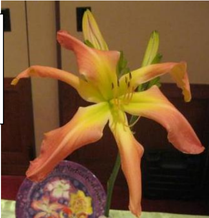
Popularity Poll: WEBSTERS PINK WONDER