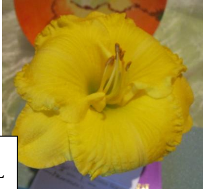
Off-Scape: MEANINGFUL GESTURE

Flower Show pictures of some of the design section exhibits will be included in the October/November newsletter.