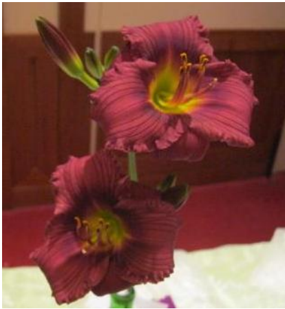
Miniature: LITTLE GRAPETTE