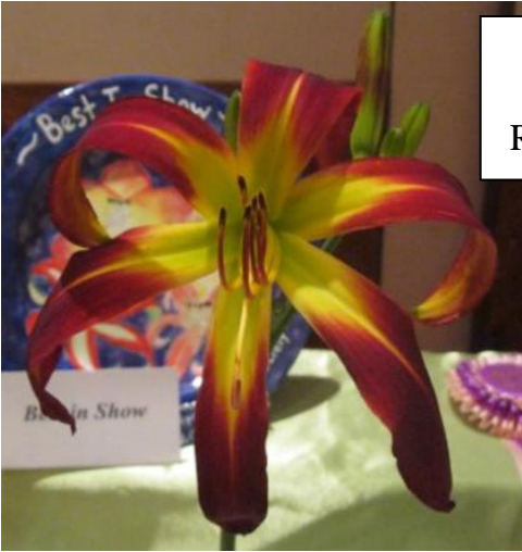
Unusual Form: RED VIPER