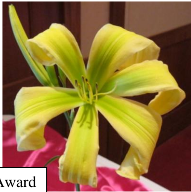
Peoples' Choice Award GREEN SWAMP GAS Ann Fowler